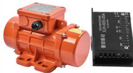
1.STANDARD REGULATOR 2.S 485 COMMUNICATION