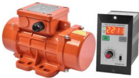
1.DIGITAL DISPLAY VERSION